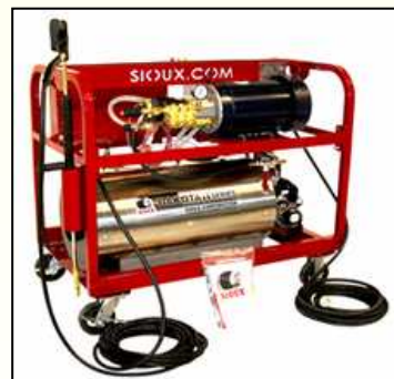
SIoux - Steam/Cold Water Cleaner