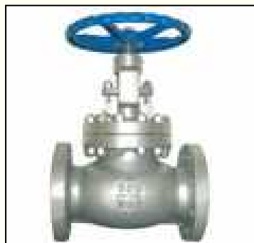
FBIC Industrial Valves