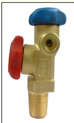
TECKNO Gas Valves