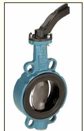
EBRO Industrial Valves